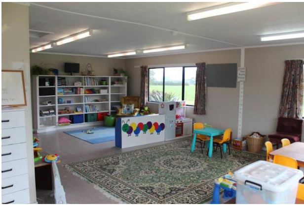
Base Creche – moved and redecorated for more space and more fun!