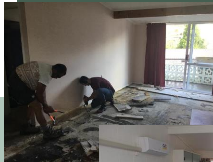
Side/Below: the process of renovating a unit and the final product