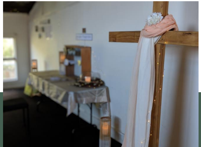
Above: House of Prayer