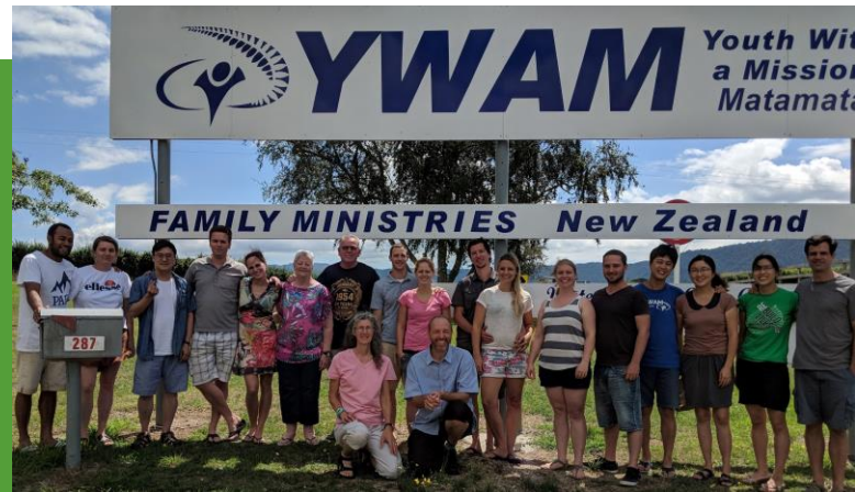
Above: FMS 2018 School Photo