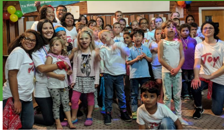
Below: Kings Kids Program in April