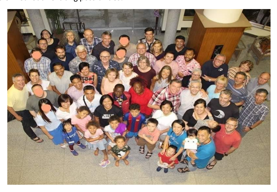
Participants at the recent International Family Ministries Conference in Bangkok, Thailand

One of the big ministry areas we want to refocus on is YWAM staff families: those in the mission field who need practical teaching, advice and support. Family Ministries has tools and knowledge that could be immensely valuable in helping establish healthy families in mission. We want Family Ministries to be viewed as a "power-house" for equipping and releasing families, not just a "hospital" for receiving those broken and burnt-out from ministry. We want to see families THRIVING, not just surviving, in ministry and mission. We hope that focusing on these families will multiply our effectiveness: As they go out and apply the tools they have learned, many other families in their ministries, communities and nations will also be reached and transformed. Such exciting possibilities!